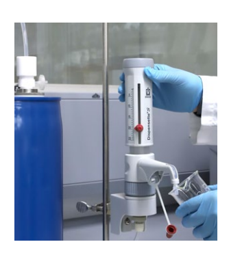
Remote Dispensing System for Drum Dispensing