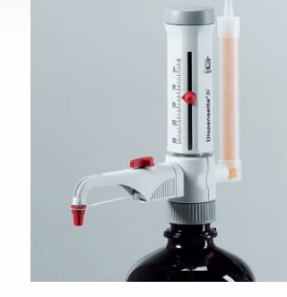
Dispensing sterile fluids