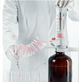
Accessories for serial dispensing