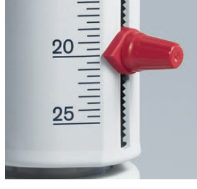
Positive volume setting using interior scalloped track