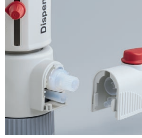
Valve system designed without seals