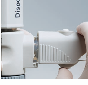
Simple-to-mount discharge tube