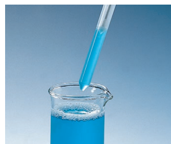
Positive displacement principle

Media which tend to foam, such as tenside solutions, pose no problem to the Transferpettor.