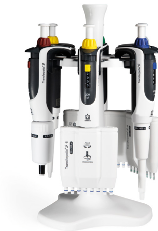
Bench top rack for 6 Transferpette® S single- or multi-channel pipettes.