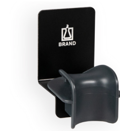
Wall mount for 1 Transferpette® S single- or multi-channel pipette.