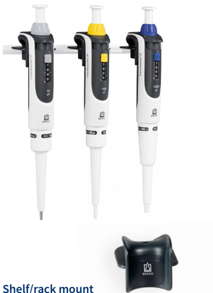
Shelf/rack mount for 1 Transferpette® S single- or multi-channel pipette.

With holders and stands, the devices are always properly stored and close at hand for the next application.